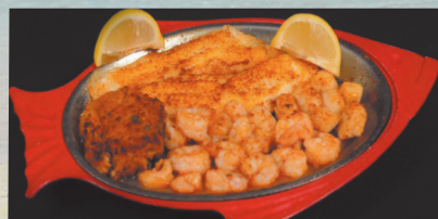
BROILED DELUXE PLATTER