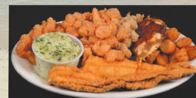
FRIED DELUXE PLATTER