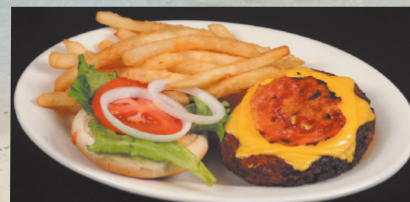
PIER 41 BURGER